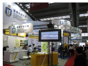
China Hi-Tech Fair (CHTF) 2010 in Shenzhen