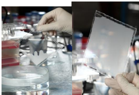
Glass with smart materials new chemical composition responds quickly to external heat and changes from transparent to translucent

PCF was implemented for the first time at HKUST in 2009/10, with funding awarded to 5 projects in the areas of leading-edge optically rewritable e-paper, innovative 3D ultrasound imaging, high efficiency Peer-to-Peer (P2P) live and interactive streaming, thermal-induced smart materials, and real-time Polymerase Chain Reaction (PCR) device for point-of-care application. With the assistance of the PCF, HKUST is collaborating with a local non-profit organization to showcase the high efficiency P2P technology through a live field trial using the