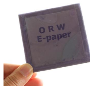
Optically rewritable e-paper enables writing, storing and rewriting information using light sources

P2P network. A local video distribution company and a Chinese investment company have expressed interest in this technology. While the projects are scheduled to complete in the second half of 2011, TTC has been monitoring the progress of these projects and is in discussion with commercial partners regarding the smart